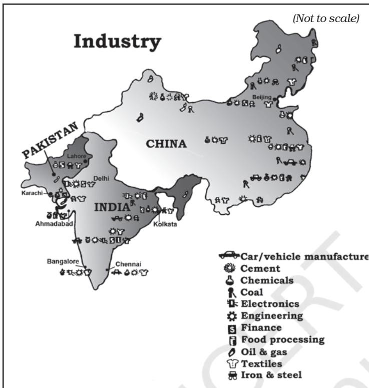
Fig. 10.3 Industry in India, China and Pakistan

Pakistan have more proportion of urban population than India. In China, due to topographic and climatic conditions, the area suitable for cultivation is relatively small — only about 10 per cent of its total land area. The total cultivable area in China accounts for 40 per cent of the cultivable area in India. Until the 1980s, more than 80 per cent of the people in China were dependent on farming as their sole source of livelihood. Since then, the government encouraged people to leave their fields and pursue other activities such as handicrafts, commerce and transport. In 2018–