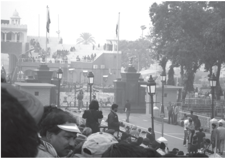
Fig. 10.1 Wagah Border is not only a tourist place but also used for trade between India and Pakistan

goods. At this stage, enterprises owned by government (known as State Owned Enterprises—SOEs), which we, in India, call public sector enterprises, were made to face competition. The reform process also involved dual pricing. This means fixing the prices in two ways; farmers and industrial units were required to buy and sell fixed quantities of inputs and outputs on the basis of prices fixed by the government and the rest were purchased and sold at market prices. Over the years, as production increased, the proportion of goods or inputs transacted in the market also increased. In order to attract foreign investors, special economic zones were set up.